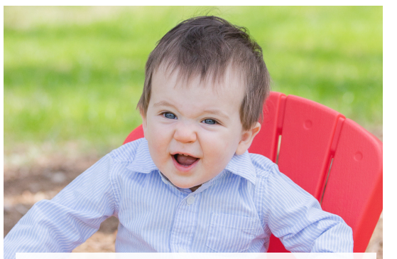
The Perfect Year | 1025 any intervals you want 4 sessions in 12 calendar mos. payment schedule: $225 booking, $225 session 1, $225 session 2, $175 session 3, $175 session 4